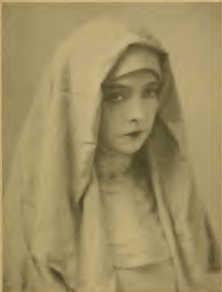
"THE WHITE SISTER"